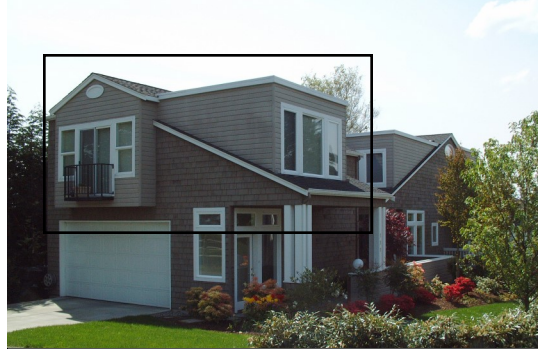
The box highlights an Accessory Dwelling Unit (ADU) above a garage