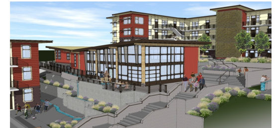
YWCA Family Village - Issaquah Highlands Funded in 2008 and 2009, construction started in 2010. Will provide 146 units of rental housing